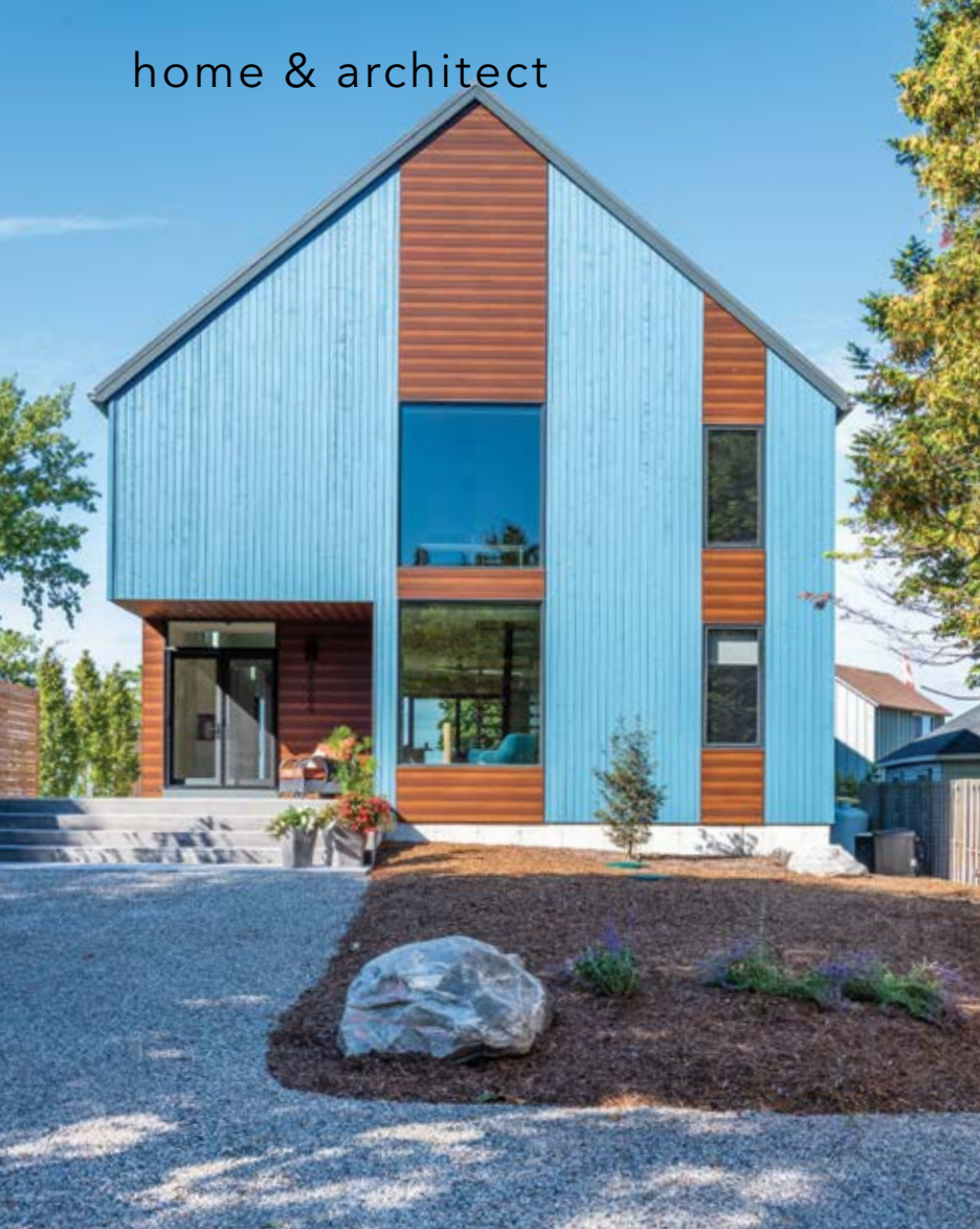
ABOVE: The front facade of this modern saltbox home. The large windows allow light to flow from the front to the back of the house. Blue siding blends the home into the summer sky and honours the water beyond. Roofing was sourced at Rona J.E. Hodgins Lumber Ltd. RIGHT: The boardwalk to the beach draws the eye to the water and protects the natural vegetation. FAR RIGHT: Brad and Heather Amlin and Joel Bartlett stand on the stairs to the rear deck. OPPOSITE: The LED pendant fixture found on Etsy takes advantage of the opening to the second level. Simply White by Benjamin Moore was used throughout. Electrical was completed by Sepoy Wiring Ltd.